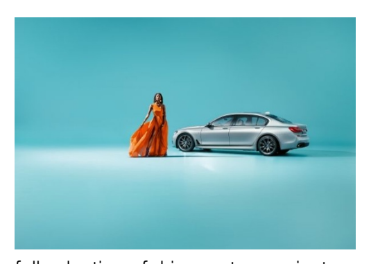
full selection of drive system variants.

design and aerodynamics. Experience from the car's first races will be channelled into the series development of the new BMW 8 Series Coupe and new BMW M8. The design of the BMW M8 GTE also reveals its close relationship with the BMW 8 Series Coupe and BMW M8.