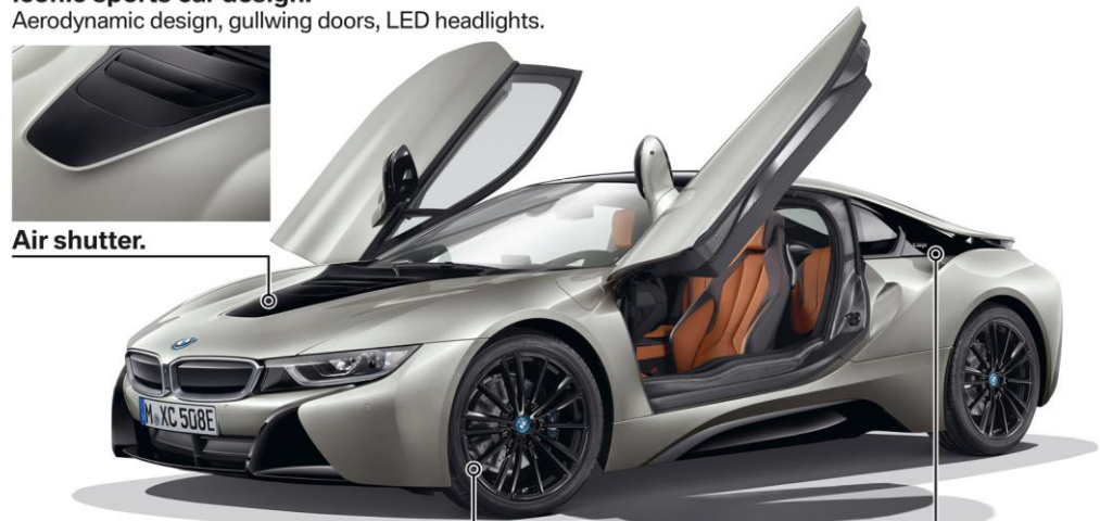
New 20-inch wheels (optional).