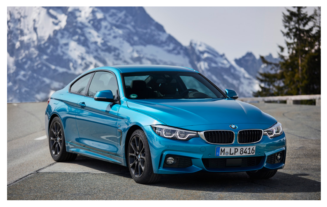
P90256441 BMW 4er Coupé / 1st generation

The new BMW 4 Series Coupé builds on this strategy, embodying the exclusive character of a two-door car – focused squarely on sporty driving pleasure – with an unmistakably unique design and specially conceived vehicle concept. With its distinctive aesthetic and carefully directed optimisation of the body structure, powertrain and chassis technology, the new BMW 4 Series Coupé sets the benchmark for driving pleasure in the premium midsize segment more definitively than ever before.