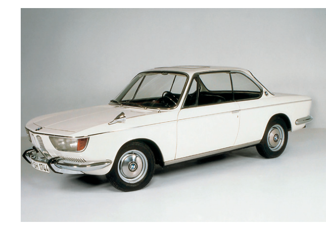
P0012083 / BMW 2000 CS

However, the genes of this successful model sat alongside a body which did not share a single element with the outer skin of a sedan. The four-cylinder midsize coupés cut a light