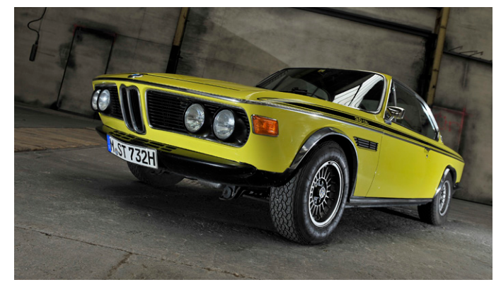
P90321069 / BMW 3.0 CSL

The 3.0 CSL's international racing career continued four years beyond the end of production, and it won the last of its six European Touring Car Championship titles in 1979.