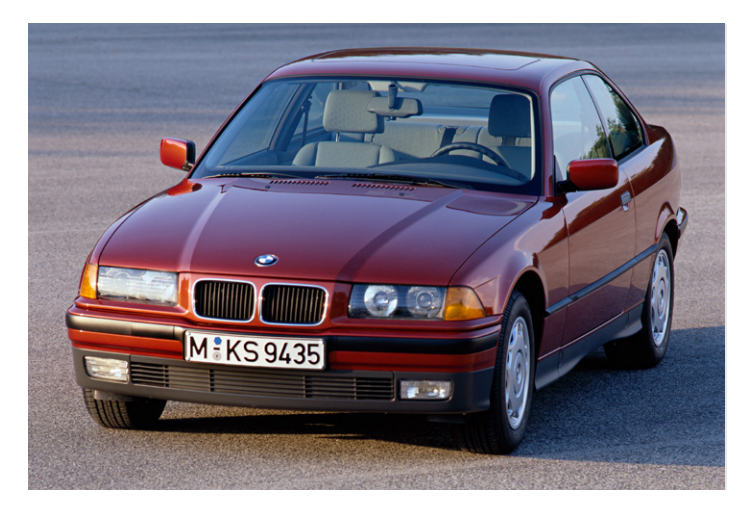
P90181333 / BMW 3er Coupé / 1st generation

In 2011, BMW presented the third generation of its luxury-class coupés, elevating sports performance and modern luxury into even higher echelons. Added to which, the coupé concept was reinterpreted with the addition of a new body variant: the BMW 6 Series Gran Coupé heralded a new breed of elegantly sporty four-door cars with a penchant for long-distance motoring.