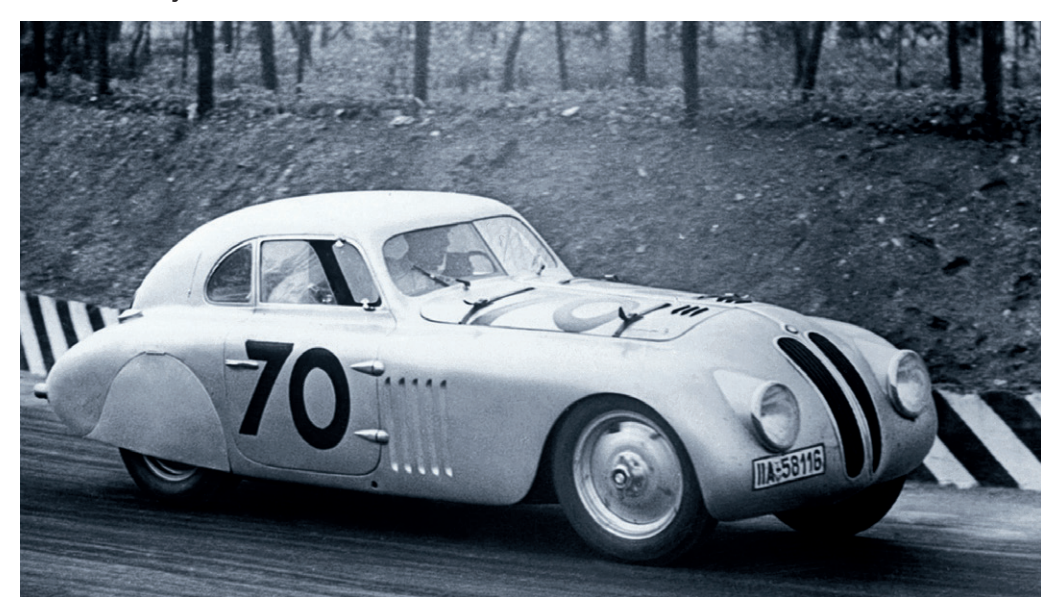
P000354 / BMW 328 Touring Coupé

"Sportcoupé" had the 80 hp engine from the BMW 328 Roadster and could hit 150 km/h (93 mph). The significant aerodynamic benefits of a hardtop body in race competition were showcased in 1940, when Fritz Huschke von Hanstein and Walter Bäumer drove a coupé version of the BMW 328 clad by coachbuilders Touring to victory in the Mille Miglia endurance race around northern Italy.