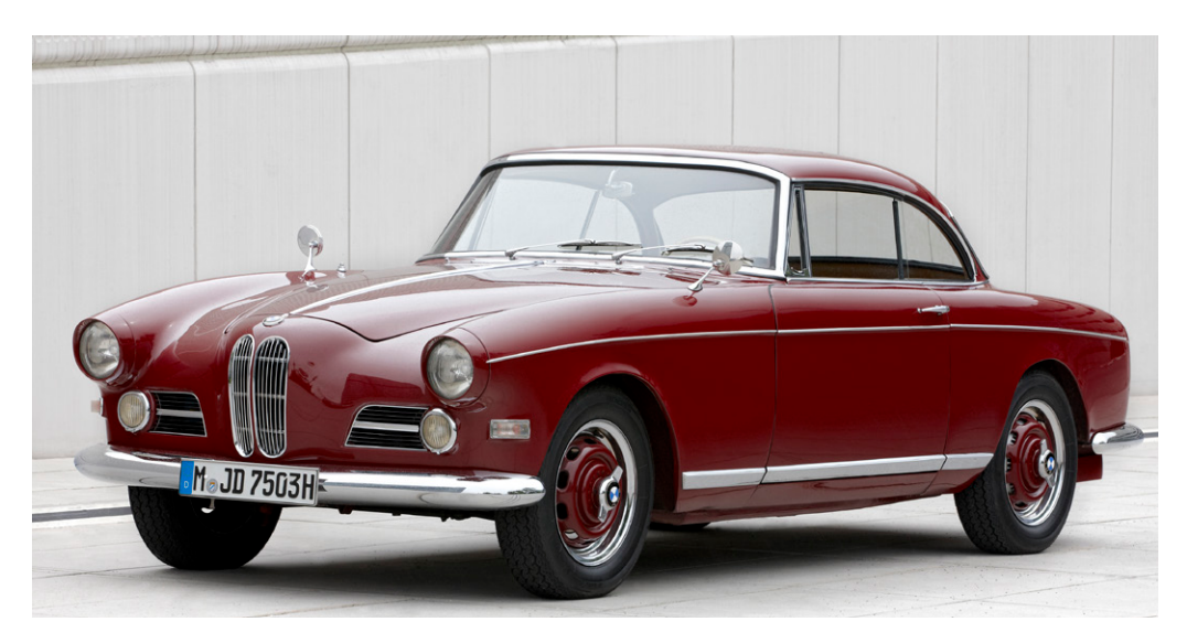
P90079631 / BMW 503 Coupé

New York-based designer Albrecht Graf Goertz is best known as the stylistic inspiration behind the legendary BMW 507 Roadster. But at the same time, he was also working on the body of the BMW 503, which was unveiled at the IAA Motor Show in Frankfurt in four-seater coupé and convertible forms. Elsewhere, his Italian contemporary Nuccio Bertone came up with the BMW 3200 CS Coupé, a modern and spacious two-door model, which celebrated its premiere at the 1961 edition of the IAA.