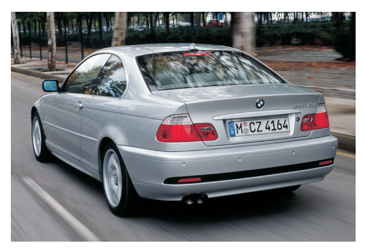
P0009658 / BMW 3er Coupé / 2nd generation