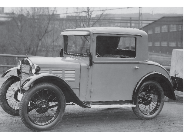
AF-24-1 / BMW 3/15 PS DA4 Coupé / 2 Sitze

The decision to buy a coupé reflects the desire for a powerfully engaging driving experience. And this keenly sports-focused breed of car has a long tradition at BMW. Cue the arrival of the latest in the line: the new BMW 4 Series Coupé is poised to bring a whole new level of dynamic potency and stylistic individuality to the premium midsize segment. The elegantly sporty two-door fuses dynamically flowing lines, a body honed to deliver agile handling, and bespoke chassis tuning. The new 4 Series Coupé connects standout looks and exceptional performance with undeniable authenticity.