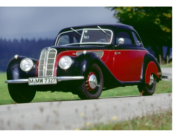
P90074034 / BMW 327/28 Coupé