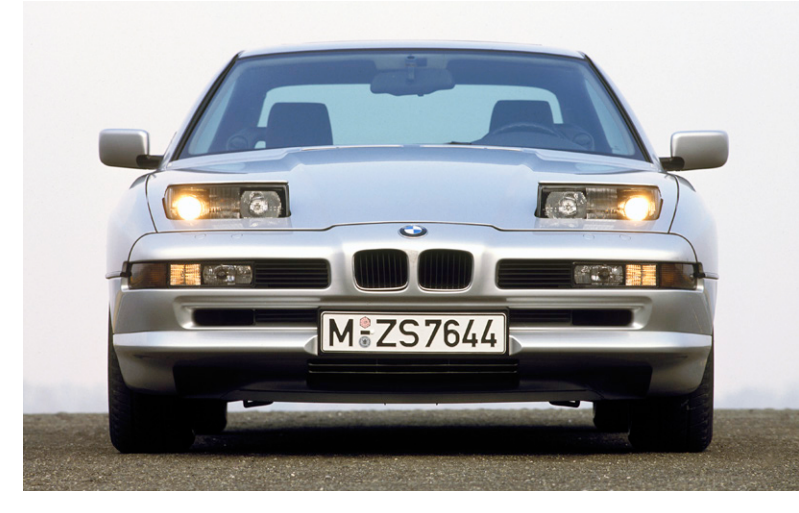
P90152307 / BMW 850i

This tradition of dynamic yet luxurious coupés continued with the BMW 850i unveiled in 1989. The wedge-shaped high-tech machine was powered by a 300 hp 12-cylinder engine and proved an enthralling proposition with its unmistakable combination of performance and long-distance comfort. Also available with an eight-cylinder engine from 1993, the 8 Series Coupé stayed in production for ten years. Only when this era