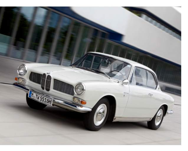
P90352641 / BMW 3200 CS

The elegant luxury coupé, powered – like its predecessor, the BMW 503 – by an eight-cylinder engine, captured the imagination with the simple elegance of its smooth-surfaced body and an intricate roofline with slender pillars. The