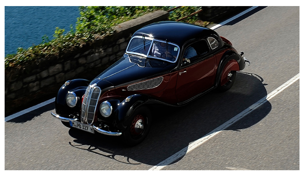
P90285373 / BMW 327/28 Coupé

The BMW 327 Coupé impressed with its modern and aerodynamically optimised design. Among its most prominent signature features were the voluptuous front wings with integrated headlights, semi-covered rear wheels and vertically split radiator grille framed by arching contours. This air aperture – later to become known as the BMW kidney grille – had been a signature feature of the brand's new six-cylinder models since the arrival of the BMW 303 in 1933. Offered alongside a 55 hp base version was the BMW 327/28 Coupé. The