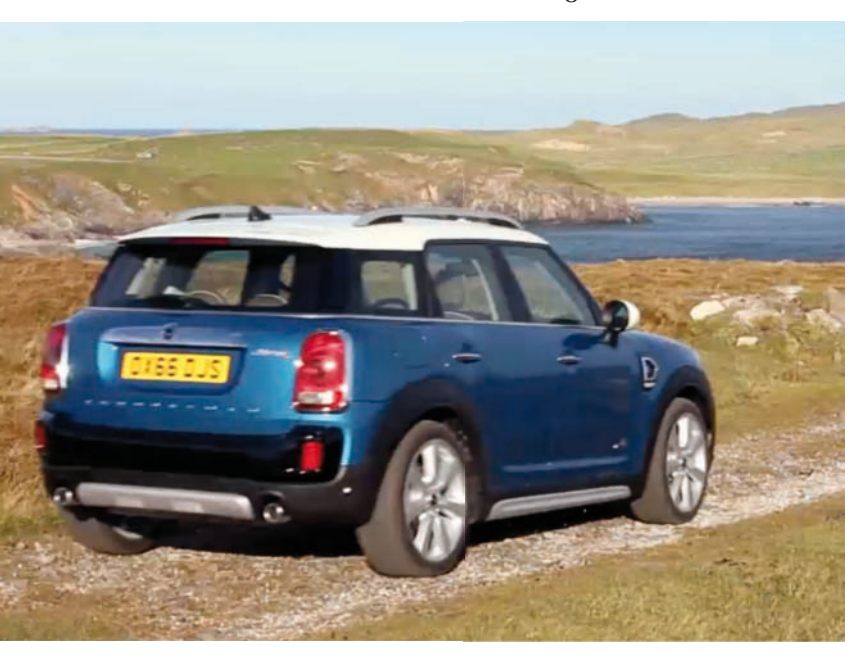
> Video LINK

Even with its model designation, the new edition of the MINI Countryman remains firmly