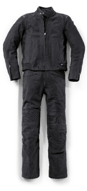
P90312307: BMW Motorrad Atlantis suit (2018)