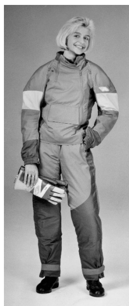
P90312309: BMW Motorrad Gore-Tex suit (1989)

Rallye suit is made of ProtechWool – a synthetic fibre with carbon finish that provides highly effective abrasion resistance since pressure and heat cause the fabric to compress.