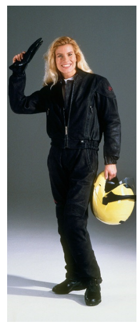
P90312306: BMW Motorrad Atlantis suit (1995)