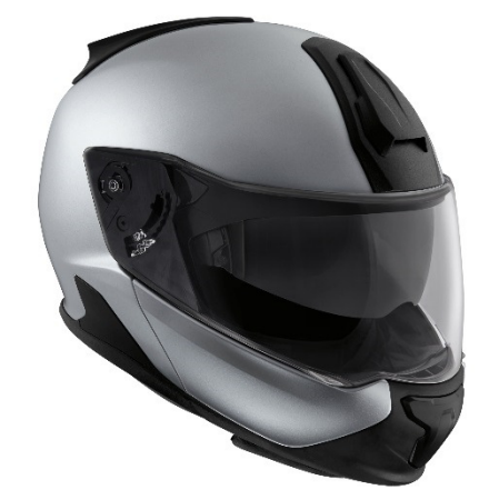
P90312316: BMW Motorrad System I helmet (1981) P90312310: BMW Motorrad System 7 Carbon helmet (2017)