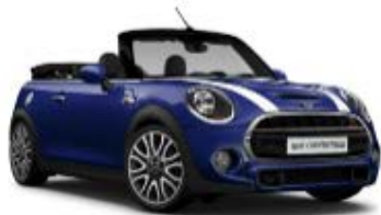
COOPER S $34,390