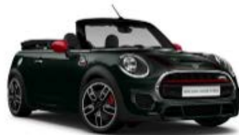
JOHN COOPER WORKS including 8 Spd Sport Auto $43,140