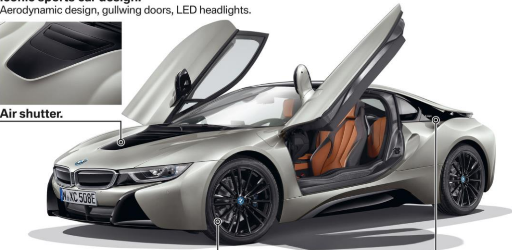
New 20-inch wheels (optional).