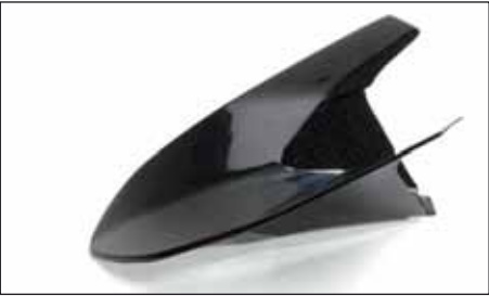
Carbon front fender