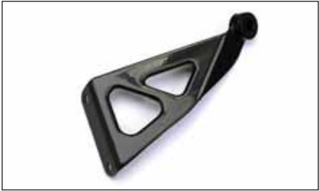
Carbon exhaust support