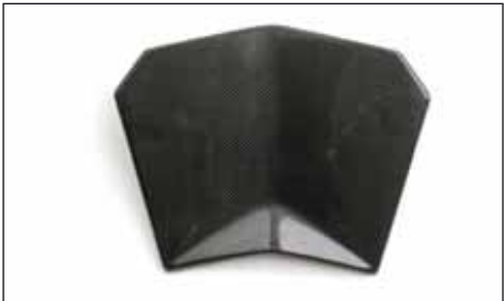
Carbon instrument cover

Made of the finest Italian carbon for a very attractive racing look combined with a considerable weight reduction.