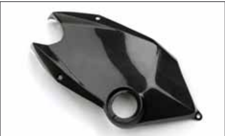
Carbon fuel tank cover