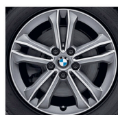
Style 549 17-inch