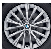
Style 547 17-inch