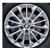
Style 546 17-inch