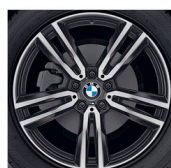
Style 766 M 19-inch