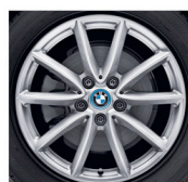
Style 683 17-inch