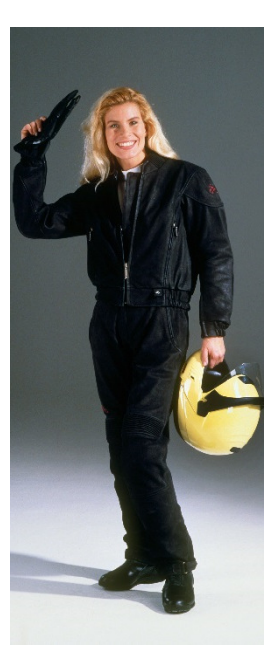
P90312306: BMW Motorrad Atlantis suit (1995)