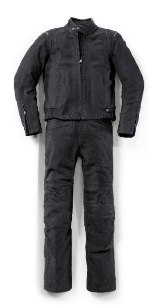
P90312307: BMW Motorrad Atlantis suit (2018)