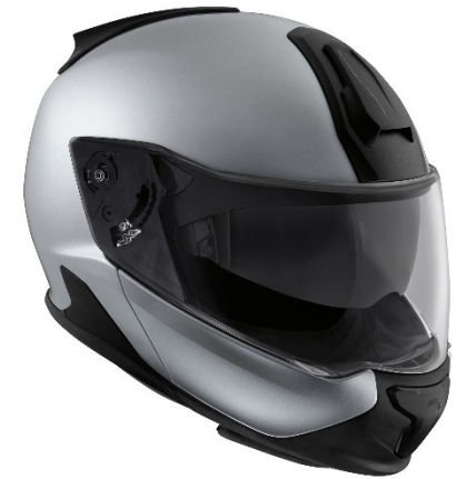
P90312316: BMW Motorrad System I helmet (1981) P90312310: BMW Motorrad System 7 Carbon helmet (2017)