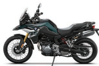
BMW F 850 GS Pollux Metallic Matte