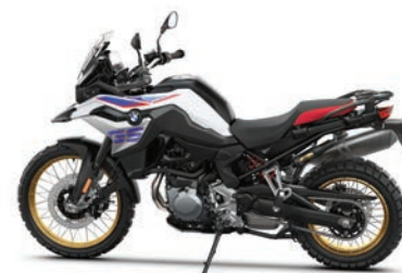
BMW F 850 GS Light White / (with tapes Racing Red / Lupin Blue Metallic)

Heated Grips, Tyre Pressure Control, Pannier Cases, LED Turn Indicators, Anti-theft Alarm, LED Auxiliary Lights, Off-road Tyres, HP Sports Silencer, Others.