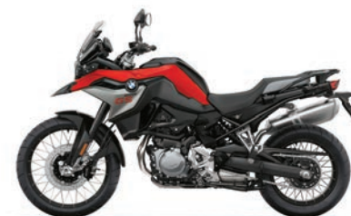
BMW F 850 GS Racing Red