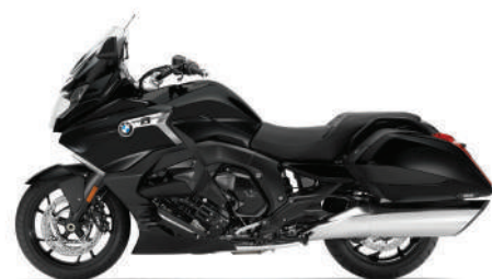
BMW K 1600 B Black Storm Metallic

Disclaimer: Subject to change in design and equipment. Subject to error. The motorcycles displayed herein may contain optional equipment. This will only be explicitly indicated where pictures of motorcycle show optional equipment.