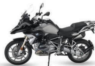
BMW R 1200 GS Black Storm Metallic

Disclaimer: Subject to change in design and equipment. Subject to error. *Only available with rallye package. **Only available with exclusive package. The motorcycles displayed herein may contain optional equipment. This will only be explicitly indicated where pictures of motorcycle show optional equipment.