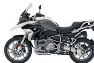
BMW R 1200 GS Light White