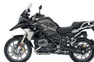
BMW R 1200 GS Iced Chocolate Metallic**