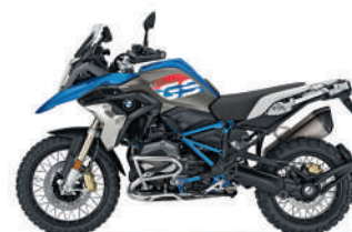
BMW R 1200 GS Lupin Blue Metallic*