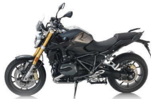
BMW R 1200 R Iced Chocolate Metallic

Optional Equipment: Dynamic Package (Daytime Riding Light, Riding Modes Pro, Sport Windshield, LED Turn Indicator, ABS Pro), Touring Package (Dynamic ESA, On-Board Computer Pro, Preparation for GPS Device, Cruise Control, Main Stand, Luggage Grid, Case Holders Left and Right), Gear Shift Assist Pro, Windshield Sport. Style 1 package (light white Cordoba blue, tank cover pure, windshield pure, engine spoiler), Style 2 package (Iced chocolate metallic, black power train)