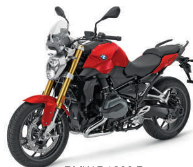
BMW R 1200 R Racing Red