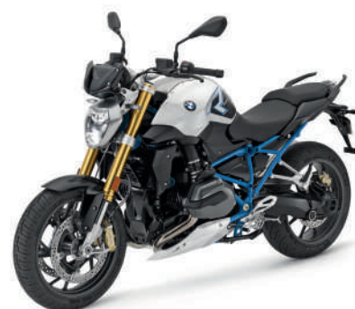
BMW R 1200 R Light White Cordoba Blue Standard**