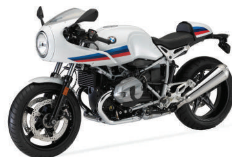
BMW R nineT Racer Light White

Optional Equipment: Aluminium Fuel Tank 1 (with Sanded Weave Weld), Aluminium Fuel Tank 2 (with Visible Weave Weld), Spoke Wheels.