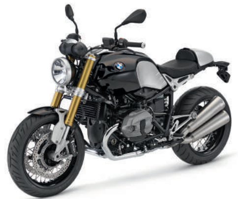
BMW R nineT Black Storm Metallic

Optional Equipment: Aluminium Fuel Tank 1 (with Sanded Weave Weld), Automatic Stability Control (ASC), Aluminium Fuel Tank 2 (with Visible Weave Weld).