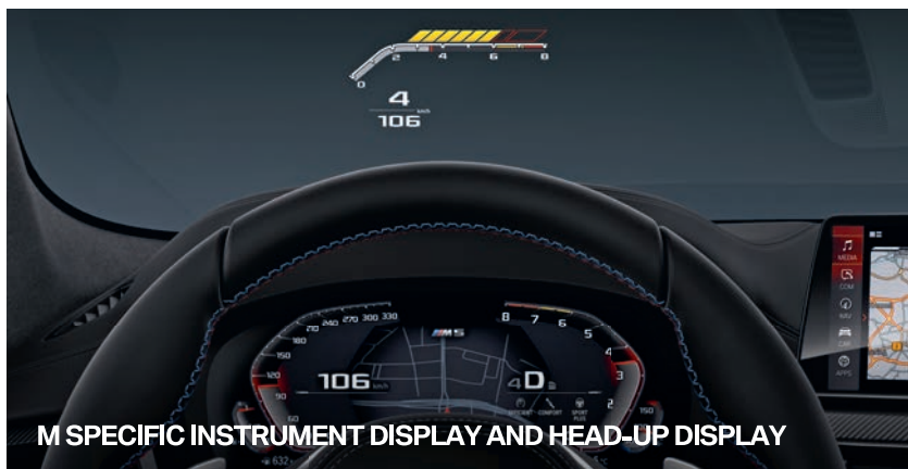
M SPECIFIC INSTRUMENT DISPLAY AND HEAD-UP DISPLAY