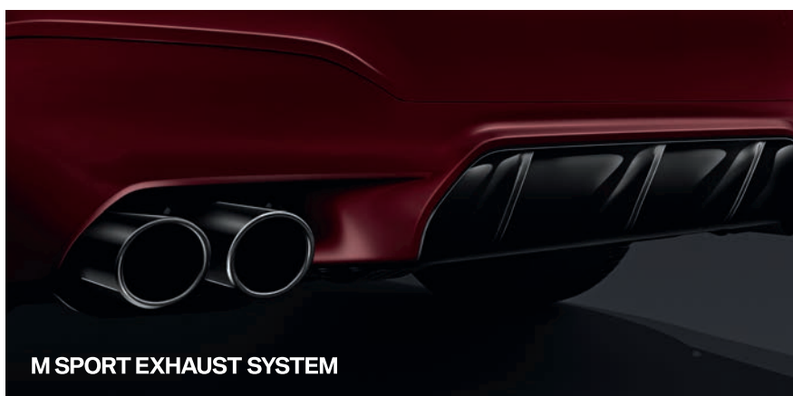
M SPORT EXHAUST SYSTEM