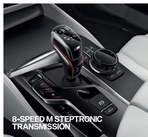
8-SPEED M STEPTRONIC TRANSMISSION