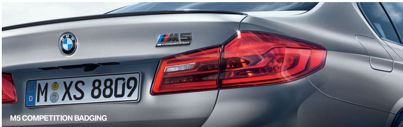
M5 COMPETITION BADGING