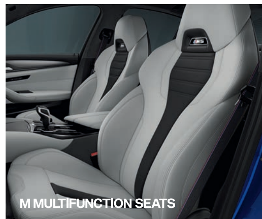
M MULTIFUNCTION SEATS