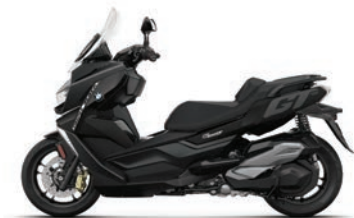
BMW C 400 GT Style Triple Black