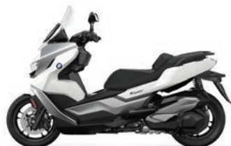
BMW C 400 GT Alpine White

Disclaimer: The models, equipment and possible vehicle configurations illustrated in this specification sheet may differ from vehicles supplied in the Indian market. For precise information, please contact your nearest authorised BMW Motorrad dealership. Subject to change in design and equipment.