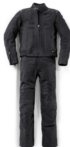
P90312307: BMW Motorrad Atlantis suit (2018)