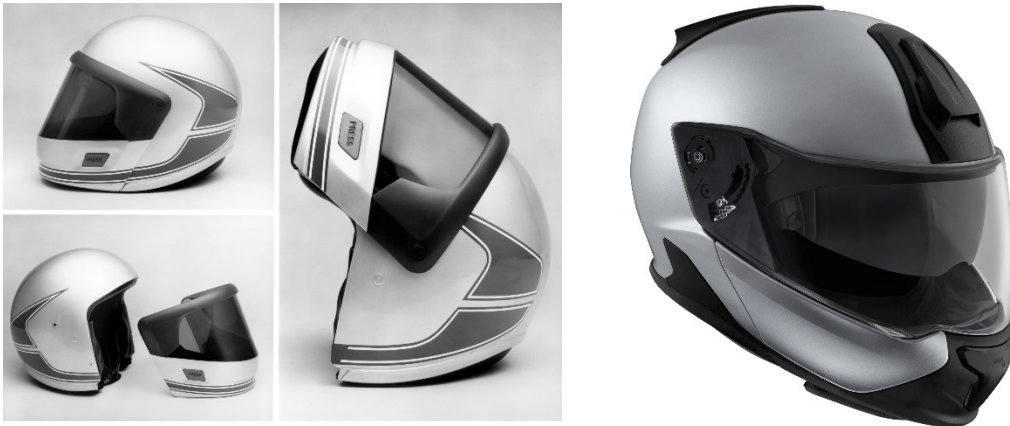
P90312316: BMW Motorrad System I helmet (1981) P90312310: BMW Motorrad System 7 Carbon helmet (2017)

Historical background: In 1980, BMW presented the System I helmet . This improved integral helmet with folding chin section was a world first that set new standards in the world of motorcycling. In 2018, the System 7 Carbon helmet is the highlight of the current rider equipment range. It can be effortlessly transformed from a system helmet to a jet helmet, meeting the very highest standards in terms of safety, aerodynamics and versatility.