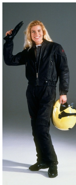
P90312306: BMW Motorrad Atlantis suit (1995)