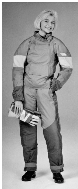
P90312309: BMW Motorrad Gore-Tex suit (1989)

Historical background: The world's first ever BMW Gore-Tex textile suit was presented in 1986 – opening up a whole new dimension of motorcycle clothing. 1990 saw the market launch of the first Kevlar-reinforced suit, the BMW PROTEC – regarded as the safest motorcycle suit in the world at the time. In 1993 BMW Motorrad presented the first waterproof leather suit. Updated every year, the Atlantis suit remains an integral part of the BMW Motorrad collection to this day. In 1997 the motorcycling world was thrilled to see the first jeans suit made of the high-tech fabric InoTex – developed exclusively for BMW Motorrad. Now in its fifth generation in 2018, the Rallye suit is made of ProtechWool – a synthetic fibre with carbon finish that provides highly effective abrasion resistance since pressure and heat cause the fabric to compress.