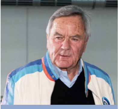
JOCHEN NEERPASCH. Founder of BMW Junior Team in 1977 Founder of BMW Motorsport GmbH

"With the new BMW Junior Team, tradition and future meet in what is a perfect configuration from our perspective. Our new concept is based on multiple pillars: racing at the Nürburgring-Nordschleife, sim racing as a new, future-oriented area, mental and fitness training at Formula Medicine, training content within the BMW Group, as well as team building through living together in shared accommodation."