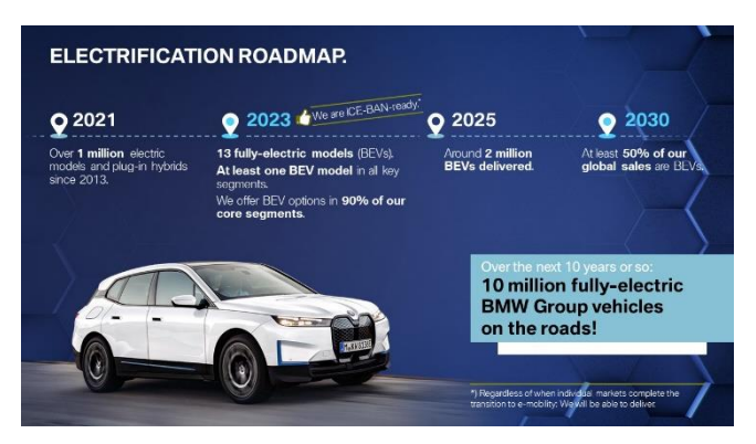
Take a look at our e-mobility roadmap up to 2030:

That is why we are electrifying BMW faster than ever and our production network is integrating electrification into the existing plant structure.