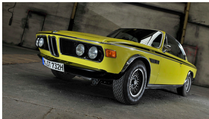
P90321069 / BMW 3.0 CSL

The 3.0 CSL’s international racing career continued four years beyond the end of production, and it won the last of its six European Touring Car Championship titles in 1979.