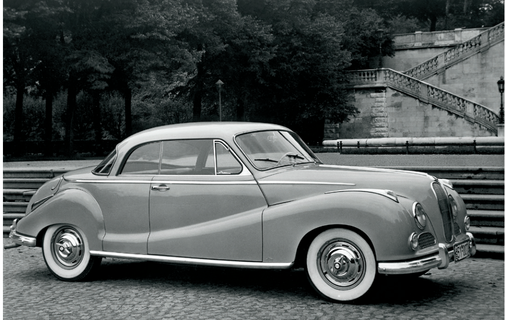
P001208 / BMW 502 Coupé