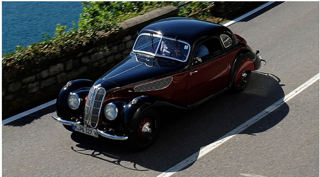
P90285373 / BMW 327/28 Coupé

The BMW 327 Coupé impressed with its modern and aerodynamically optimised design. Among its most prominent signature features were the voluptuous front wings with integrated headlights, semi-covered rear wheels and vertically split radiator grille framed by arching contours. This air aperture – later to become known as the BMW kidney grille – had been a signature feature of the brand's new six-cylinder models since the arrival of the BMW 303 in 1933. Offered alongside a 55 hp base version was the BMW 327/28 Coupé. The