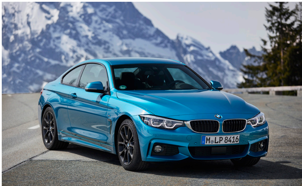
P90256441 BMW 4er Coupé / 1st generation

The new BMW 4 Series Coupé builds on this strategy, embodying the exclusive character of a two-door car – focused squarely on sporty driving pleasure – with an unmistakably unique design and specially conceived vehicle concept. With its distinctive aesthetic and carefully directed optimisation of the body structure, powertrain and chassis technology, the new BMW 4 Series Coupé sets the benchmark for driving pleasure in the premium midsize segment more definitively than ever before.