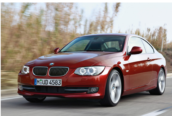
P90054805 / BMW 3er Coupé / 3rd generation