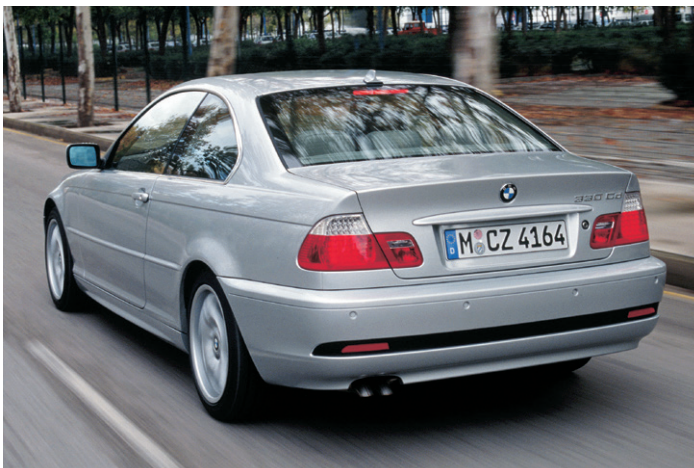
P0009658 / BMW 3er Coupé / 2nd generation