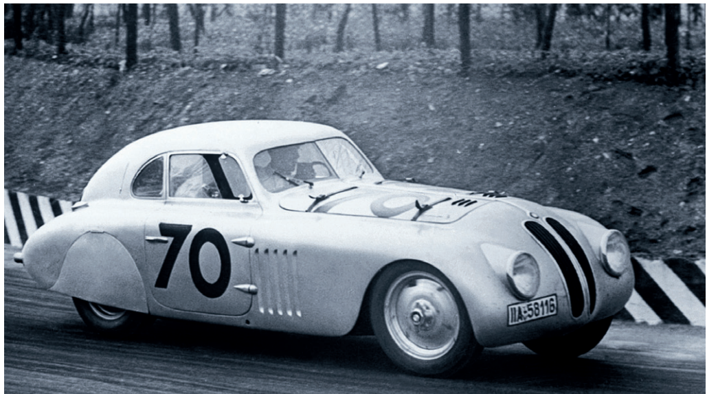
P000354 / BMW 328 Touring Coupé

“Sportcoupé” had the 80 hp engine from the BMW 328 Roadster and could hit 150 km/h (93 mph). The significant aerodynamic benefits of a hardtop body in race competition were showcased in 1940, when Fritz Huschke von Hanstein and Walter Bäumer drove a coupé version of the BMW 328 clad by coachbuilders Touring to victory in the Mille Miglia endurance race around northern Italy.