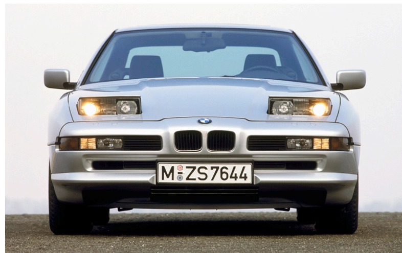
P90152307 / BMW 850i

This tradition of dynamic yet luxurious coupés continued with the BMW 850i unveiled in 1989. The wedge-shaped high-tech machine was powered by a 300 hp 12-cylinder engine and proved an enthralling proposition with its unmistakable combination of performance and long-distance comfort. Also available with an eight-cylinder engine from 1993, the 8 Series Coupé stayed in production for ten years. Only when this era