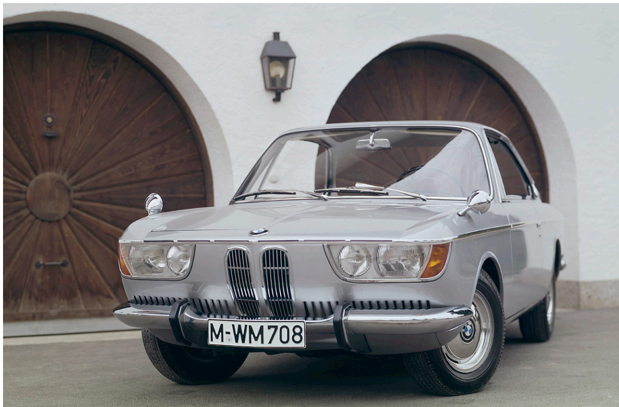
P90074548 / BMW 2000 CS

The four-cylinder midsize coupés cut a light and delicate figure with their low roofline, thin pillars and generous expanses of glass, and their design also borrowed from the eight-cylinder BMW 3200 CS Coupé. The Plexiglas-covered headlights either side of the vertical kidney grille were a totally new design feature.