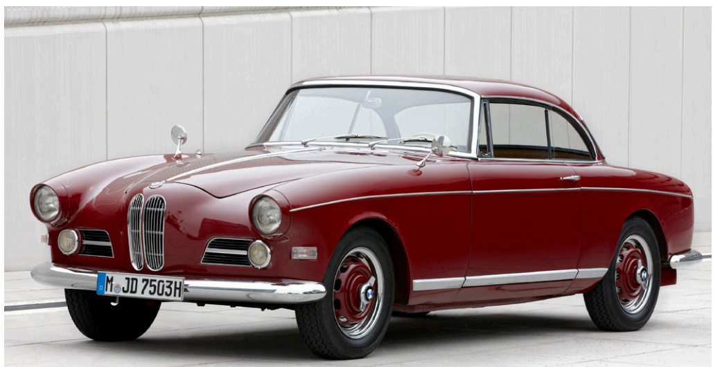
P90079631 / BMW 503 Coupé

New York-based designer Albrecht Graf Goertz is best known as the stylistic inspiration behind the legendary BMW 507 Roadster. But at the same time, he was also working on the body of the BMW 503, which was unveiled at the IAA Motor Show in Frankfurt in four-seater coupé and convertible forms. Elsewhere, his Italian contemporary Nuccio Bertone came up with the BMW 3200 CS Coupé, a modern and spacious two-door model, which celebrated its premiere at the 1961 edition of the IAA.