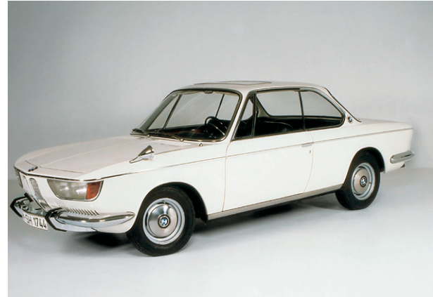
P0012083 / BMW 2000 CS

Unlike other manufacturers, who turned sedans into coupés with relatively minor changes to the body, BMW took the far more complex approach of a clean-sheet design. The BMW 2000 C and BMW 2000 CS models presented in June 1965 were developed on the technical basis of the Neue Klasse.