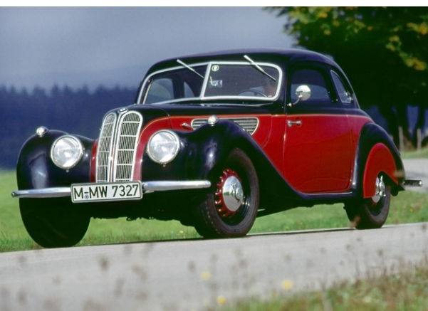
P90074034 / BMW 327/28 Coupé

Gracefully sporting coupés have played a defining role in the model history of BMW, championing the cause of driving pleasure and aesthetic appeal across the vehicle spectrum from day one. This heritage extends back to the company's formative years as a carmaker. Almost 90 years ago, a distinctive design profile and sharper driving qualities injected the coupé variant of the brand's first car with a character of its own. As a two-seater model with a shortened, enclosed body, the BMW 3/15 PS DA 4 occupied a sparsely populated niche, and only 210 examples were made in Eisenach over the course of 1931.