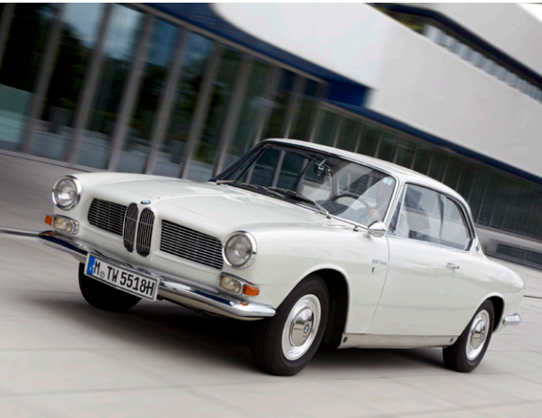
P90352641 / BMW 3200 CS

The elegant luxury coupé, powered – like its predecessor, the BMW 503 – by an eight-cylinder engine, captured the imagination with the simple elegance of its smooth-surfaced body and an intricate roofline with slender pillars. The