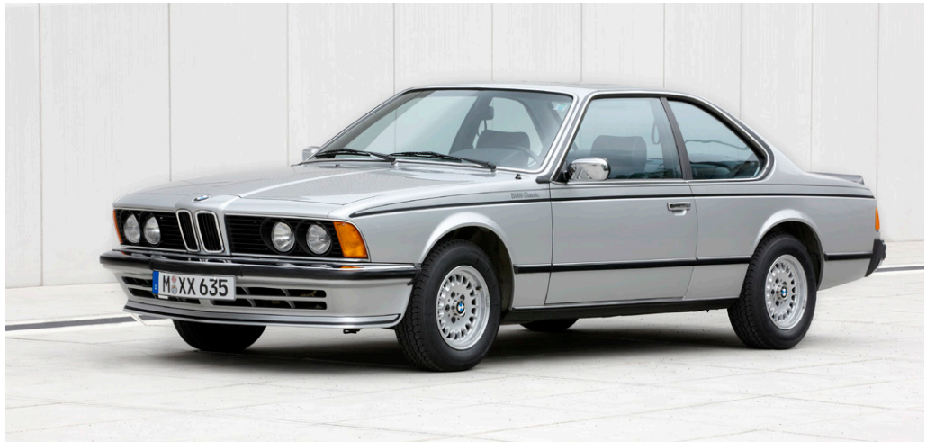
P90079648 / BMW 635CSi