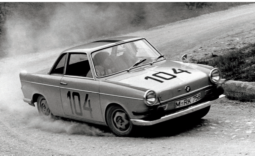
P0036378 / BMW 700 Coupé

A few years later, the time was right for a fully-fledged small car to take to the roads. Turin designer Giovanni Michelotti played a central role in creating the form of the BMW 700, which was initially presented as a coupé in June 1959. The sedan model followed three months later. The BMW 700 stayed in production until 1965, becoming the brand’s highest-selling model up to that point and playing a major role in easing the company through its economic difficulties at the time. The BMW 700 Coupé also embarked on a notable career in international motor sport.