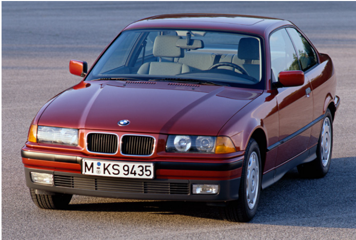
P90181333 / BMW 3er Coupé / 1st generation

In 2011, BMW presented the third generation of its luxury-class coupés, elevating sports performance and modern luxury into even higher echelons. Added to which, the coupé concept was reinterpreted with the addition of a new body variant: the BMW 6 Series Gran Coupé heralded a new breed of elegantly sporty four-door cars with a penchant for long-distance motoring.