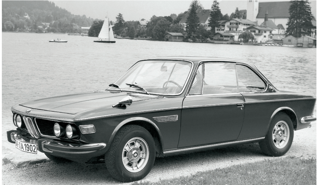
P0012086 / BMW 2800 CS

The next stage in the evolution of the BMW coupé followed the introduction of the new luxury-class sedans with six-cylinder in-line engine in 1968. The coupé generation developed alongside the four-door models had an extended