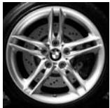
M Double-spoke 224