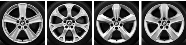
SA2C9 SA2LD SA2RX SA2RY