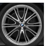
V-spoke styling 649 SA2T3