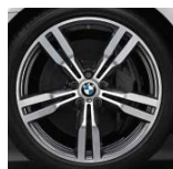
Double-spoke styling 648 M SA21H◆