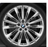
W-spoke styling 646 SA27Z