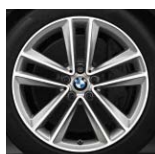
Double-spoke styling 630 SA24L