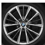
W-spoke styling 643 SA27X