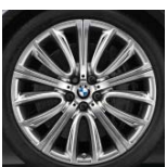
V-spoke styling 628 SA24N