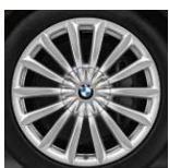
V-spoke styling 620 SA23K