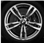
Double-spoke styling 441 M SA21B