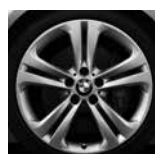
Double-spoke styling 401 SA2A4