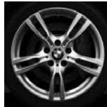
Star-spoke styling 400 M SA2PE