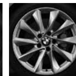
Turbine styling 415 SA2P5