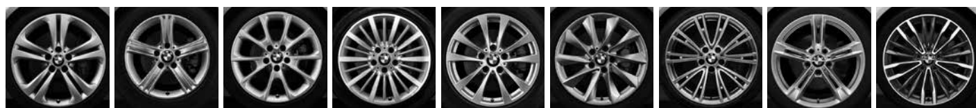
Double-spoke styling 401 SA2A4 Star-spoke styling 393 SA2DW V-spoke styling 398 SA2FM Multi-spoke styling 416 SA2H2 V-spoke styling 395 SA2L3 Turbine styling 415 SA2P5 V-spoke styling 626 SA2T0 Star-spoke styling 707 SA25G Multi-spoke styling 708 SA29D