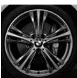
Star-spoke styling 407 SA25H