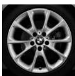
V-spoke styling 398 SA2FM