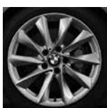
Turbine styling 415 SA2P5