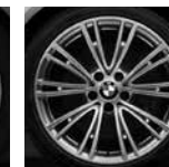
V-spoke styling 626 SA2T0