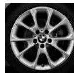
V-spoke styling 398 SA2FM