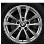
V-spoke styling 395 SA2L3