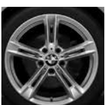
Star-spoke styling 707 SA25G