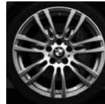
Star-spoke styling 403 M SA2PF