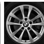
V-spoke styling 395 SA2L3