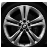
Double-spoke styling 401 SA2A4