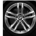
Double-spoke styling 704 M Orbit Grey SA21W