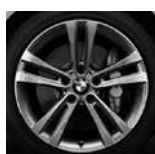
Double-spoke styling 397 SA2A5