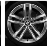
Double-spoke styling 704 M Ferric Grey SA21Z