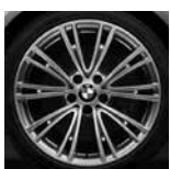
V-spoke styling 626 SA2T0