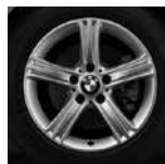
Star-spoke styling 393 SA2DW