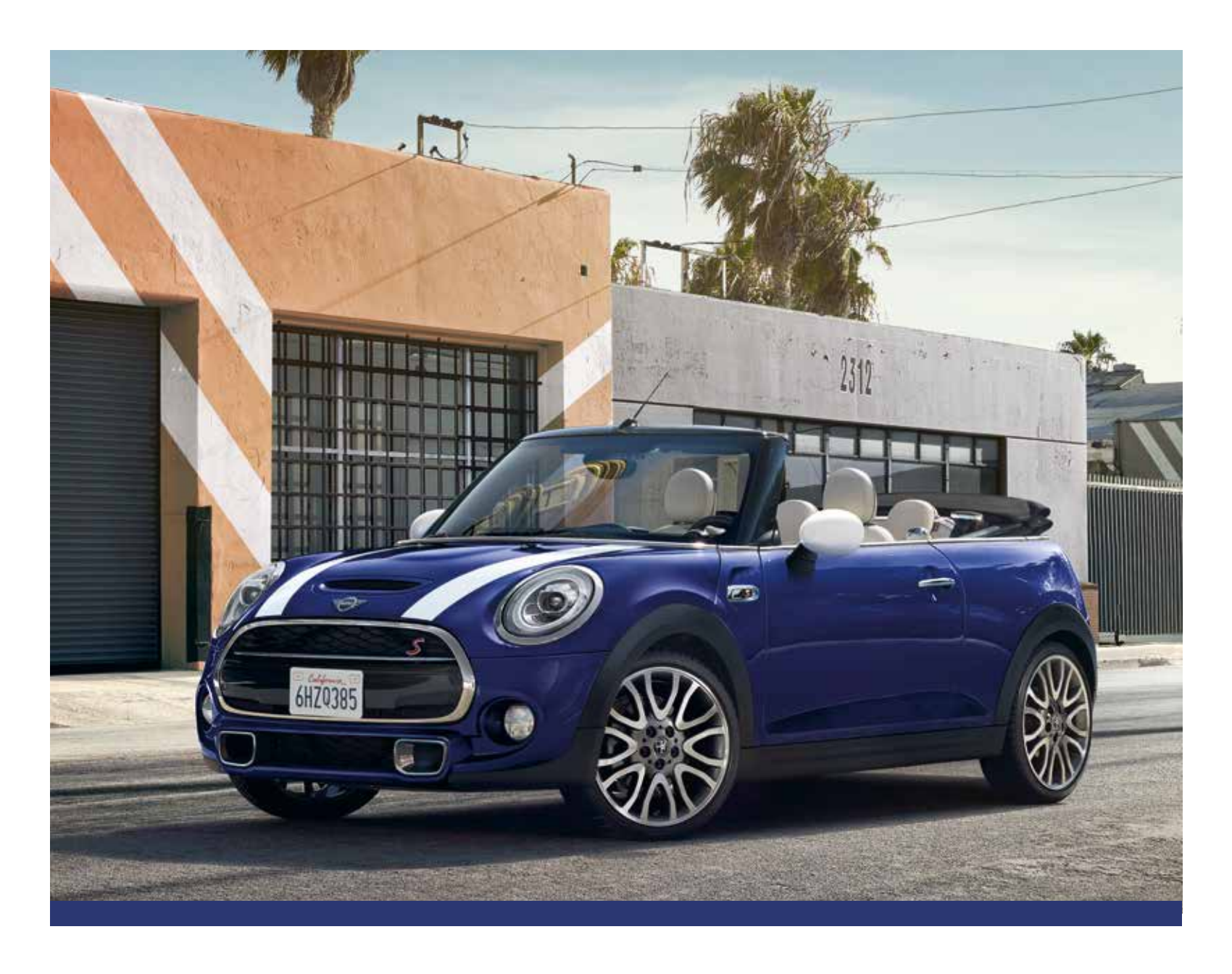
PRICE LIST. MINI Cooper Convertible. MINI Cooper S Convertible.