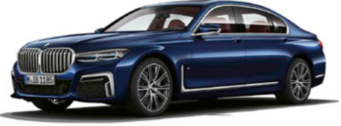
BMW Individual 750Li xDrive in BMW Individual Tanzanite Blue metallic with 20" BMW Individual light-alloy wheels V-spoke 649 I (please note that visual shown is for a vehicle in combination with M Sport package)