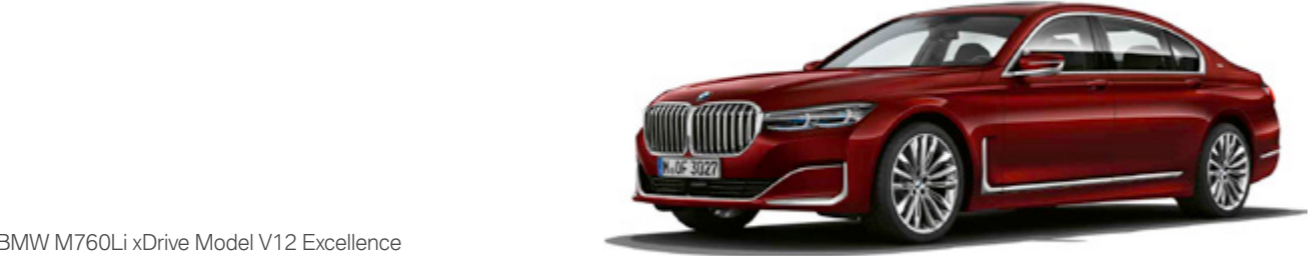
BMW M760Li xDrive Model V12 Excellence