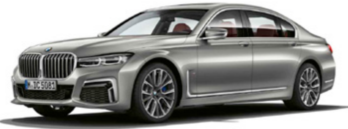
BMW Individual 750Li xDrive in Donington Grey metallic with optional 20" M light-alloy wheels star spoke 817 M