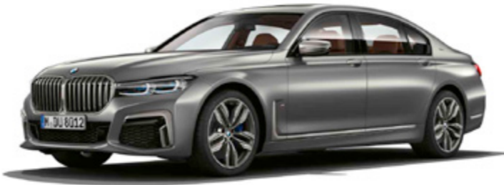
BMW M760Li xDrive in BMW Individual Frozen Dark Silver metallic with 20" M light-alloy wheels double spoke 760 M