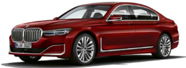
BMW M760Li xDrive Model V12 Excellence in BMW Individual Aventurine Red II metallic with 20" light-alloy wheels W-spoke 646