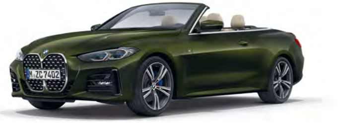
BMW 4 Series Convertible in Sanremo Green with Individual light-alloy wheels Double-spoke 793