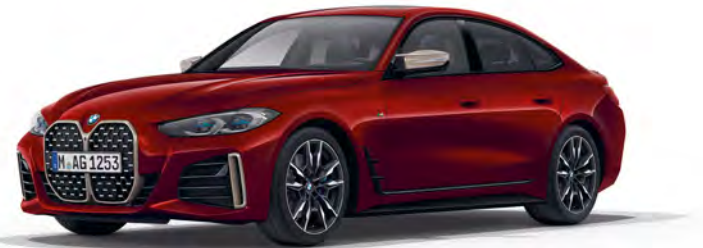
BMW M440i xDrive in Aventurine Red III metallic with M light-alloy wheels Double-spoke 861 M