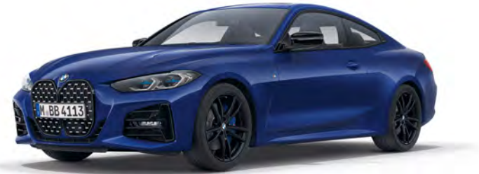
BMW 420i in Portimao Blue metallic with M light-alloy wheels Double-spoke 791 M