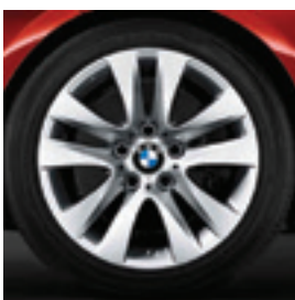
17" V-spoke style 338