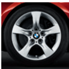
17" Star-spoke style 339