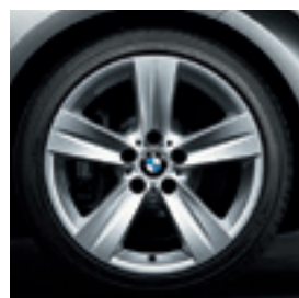
18" Star-spoke style 189