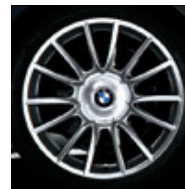
19" BMW Individual V-spoke style 228 I