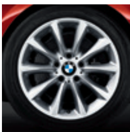
17" Star-spoke style 340