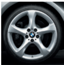
19" Star-spoke style 230