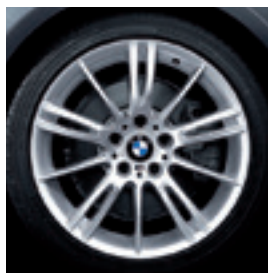
18" M Star-spoke style 193 M