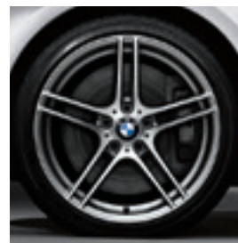
19" M Double-spoke style 313 M