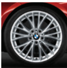
18" V-spoke style 342