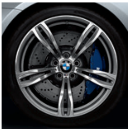
20" M Double-spoke style 343 M