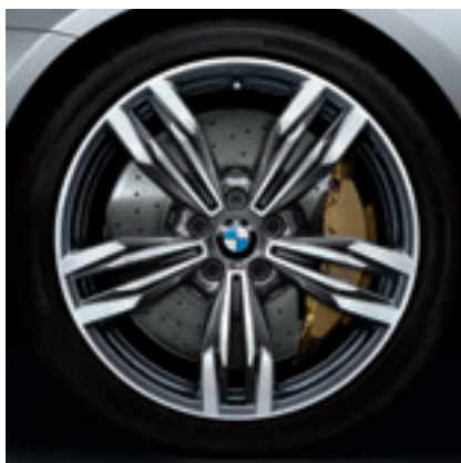
20" M Double-spoke style 433 M*