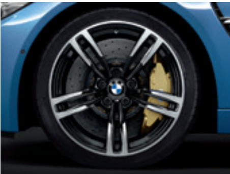
19" M Double-spoke style 437 M, Jet Black