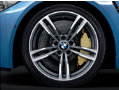
19" M Double-spoke style 437 M, Ferric Grey