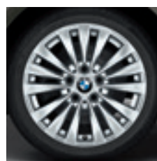
17" Multi-spoke style 475