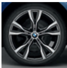
18" Y-spoke style 484