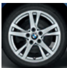
16" Double-spoke style 473