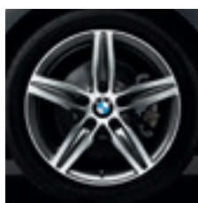
17" Star-spoke style 379