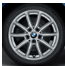
16" V-spoke style 471