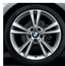
17" Double-spoke style 385