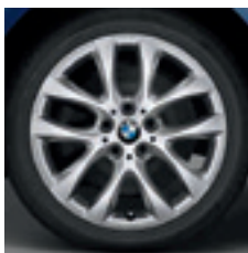
17" V-spoke style 479