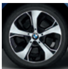
16" Turbine style 472