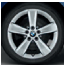
17" Star-spoke style 478