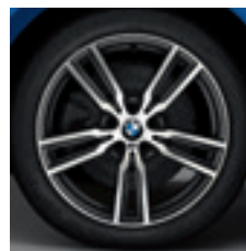
18" M Double-spoke style 486*