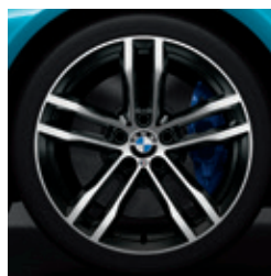
19" M Double-spoke style 704 M, Bicolour Orbit Grey