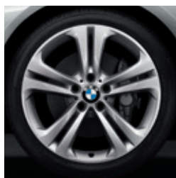
19" Double-spoke style 401