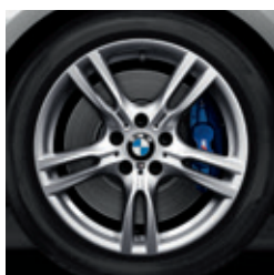
18" M Double-spoke style 400 M