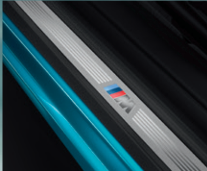
Door sill finishers with M designation