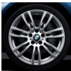
19" M Star-spoke style 403 M