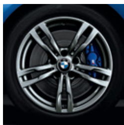
18" M Double-spoke style 441 M, Ferric Grey