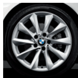
18" Turbine style 415