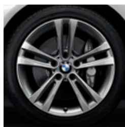
18" Double-spoke style 397