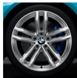
19" M Double-spoke style 704 M