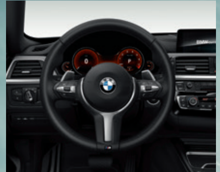
M Sport multi-function leather steering wheel, three-spoke