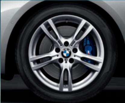
18" light alloy M Double-spoke style 400 M wheels