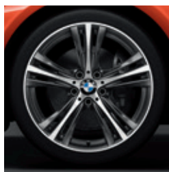
19" Double-spoke style 407, Bicolour Orbit Grey