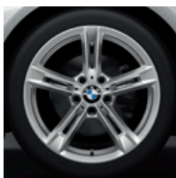
18" Star-spoke style 707