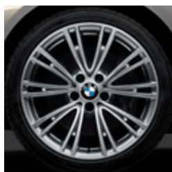
19" BMW Individual V-spoke style 626 I, Ferric Grey