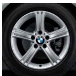
17" Star-spoke style 393