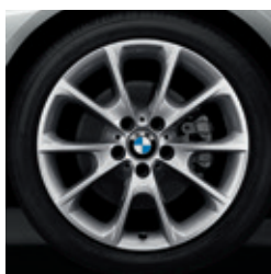
18" V-spoke style 398