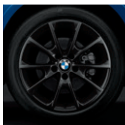
18" V-spoke style 398, Orbit Grey