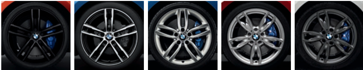
18" Double-spoke style 719 M, Jet Black18" M Double-spoke style 719 M, Bicolour Jet Black18" M Double-spoke style 461 M, Ferric Grey18" M Double-spoke style 436 M, Ferric Grey18" M Double-spoke style 436 M, Orbit Grey