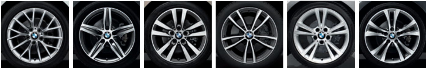
17" Y-spoke style 38017" Star-spoke style 37917" Double-spoke style 65517" Double-spoke style 72518" Double-spoke style 38518" Y-spoke style 384