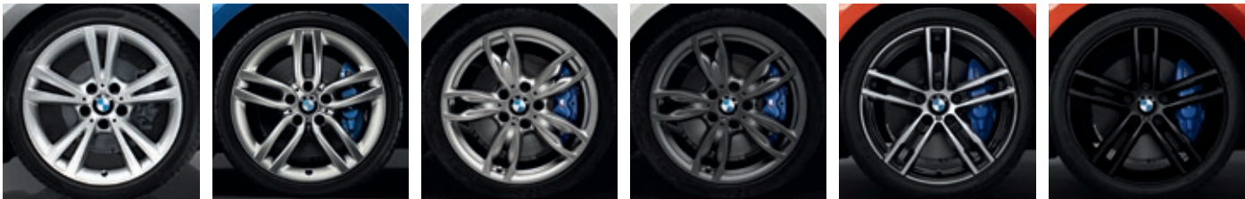
18" Double-spoke style 38518" M Double-spoke style 461 M, Ferric Grey18" M Double-spoke style 436 M18" M Double-spoke style 436 M, Orbit Grey18" M Double-spoke style 719 M, Bicolour Jet Black18" M Double-spoke style 719 M, Jet Black