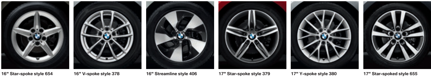
16" Star-spoke style 65416" V-spoke style 37816" Streamline style 40617" Star-spoke style 37917" Y-spoke style 38017" Star-spoked style 655