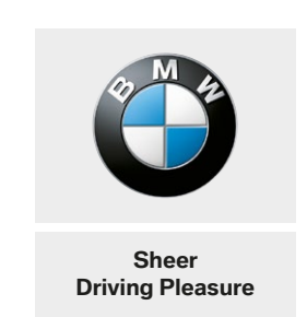
ABB FIA FORMULA E CHAMPIONSHIP 2017/18.