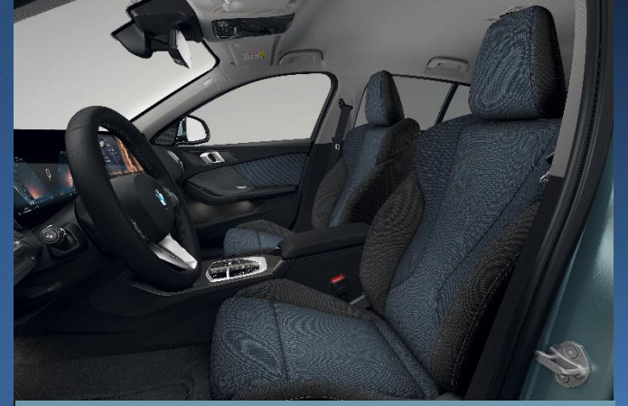
Heated Front Seats