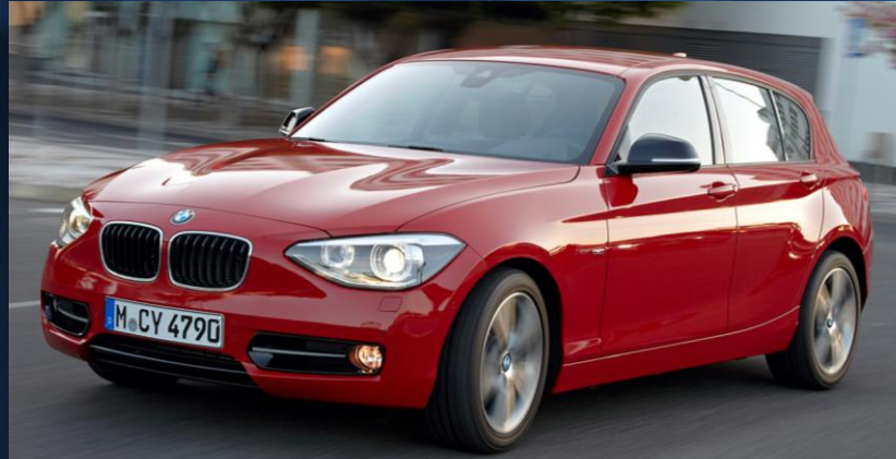
2 nd Generation | 2011 – 2019