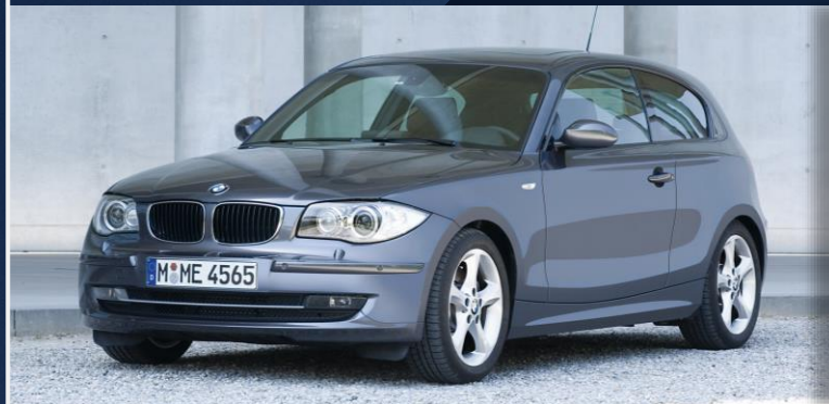
BMW 1 Series 3-door