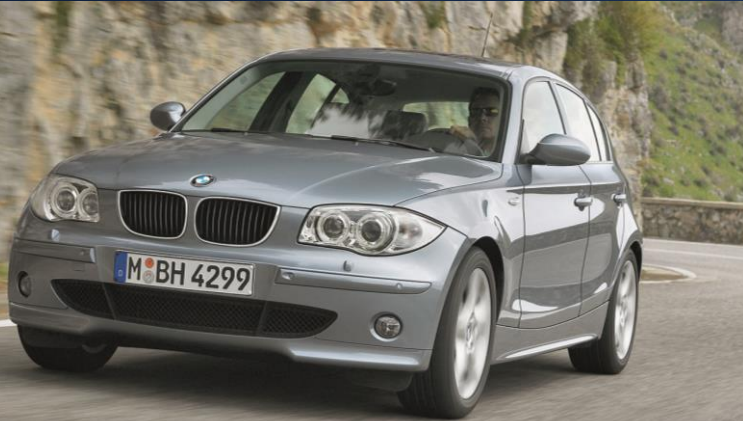
1 st Generation | 2004 – 2011