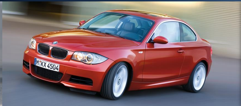
BMW 1 Series Coupé