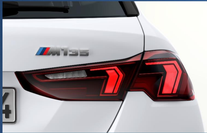
New LED Headlight and Taillight Design