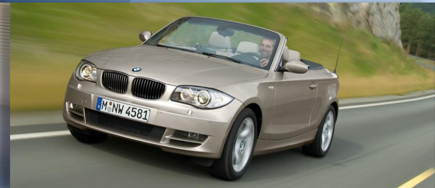
BMW 1 Series Convertible