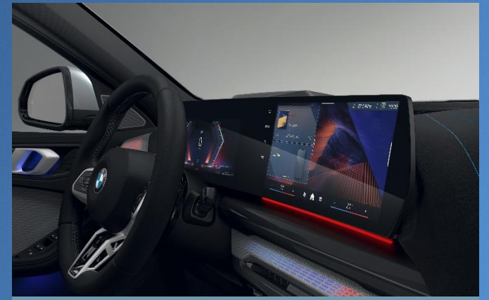
Curved Widescreen Display with OS9