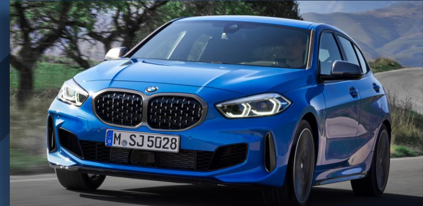
3 rd Generation | 2019 – 2024