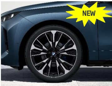
23" BMW Individual Aerodynamic Wheels 1028 Multicolour 3D polished buff***