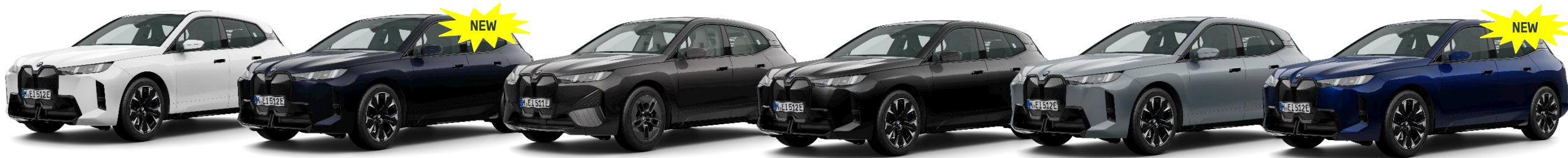
Alpine White (Standard)