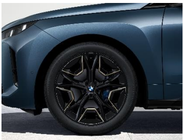
22" Aerodynamic Wheels 1023 Bicolour Titanium Bronze 3D polished buff**