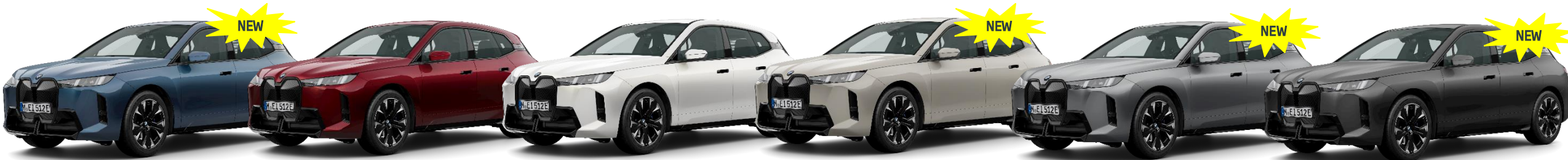
Arctic Race Blue