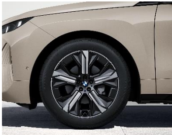
21" Aerodynamic Wheels 1012 Bicolour 3D polished buff