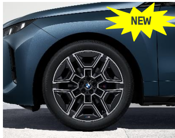
22" M Aerodynamic Wheels 1025 M Multicolour 3D polished buff*