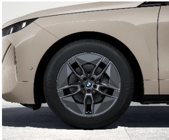
20" Aerodynamic Wheels 1002 Dark Grey matt (Standard)