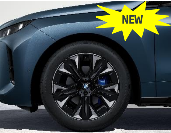
21" M Aerodynamic Wheels 1024 M Multicolour 3D polished buff (Standard)