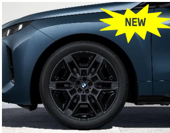
22" M Aerodynamic Wheels 1027 M Bicolour Jet Black with sport tyres