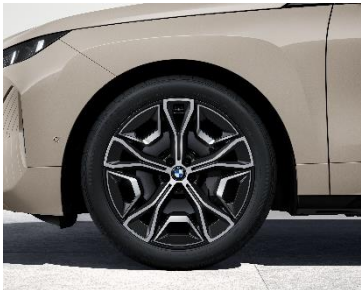
22" Aerodynamic Wheels 1021 Multicolour 3D polished buff