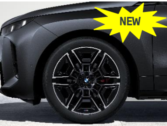
22" M Aerodynamic Wheels 1026 M Multicolour 3D polished buff (Standard)