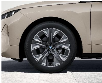
21" Aerodynamic Wheels 1010 Bicolour 3D polished buff