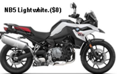
NB5 Light white. ($0)