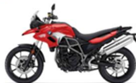
Predecessor (F 700 GS):