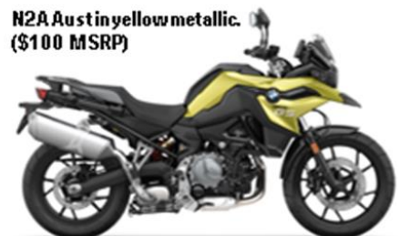
N2A Austin yellow metallic. ($100 MSRP)