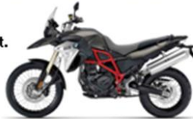
Predecessor (F 800 GS)